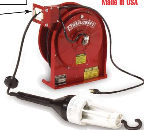
L 5245 A 163 6X