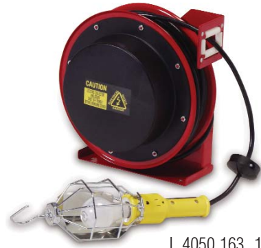
L 4050 163 1