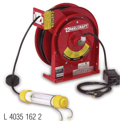
L 4035 162 2

NOTE: Swing brackets should be used if cords are pulled at more than 45°, see page 49.