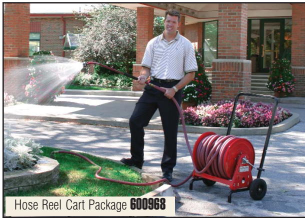
Orchard Ridge Country Club, Fort Wayne, Indiana