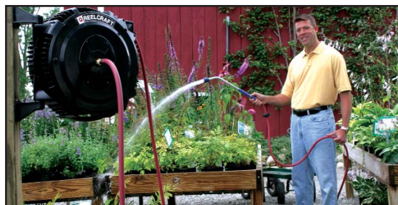
Arbor Farms Nursery, Fort Wayne, Indiana

Pound for pound the S series offers distinct weight advantages due to the composite case construction.